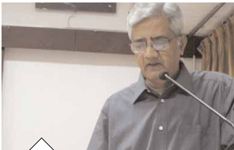
GUJARATI POET KAMAL VORA