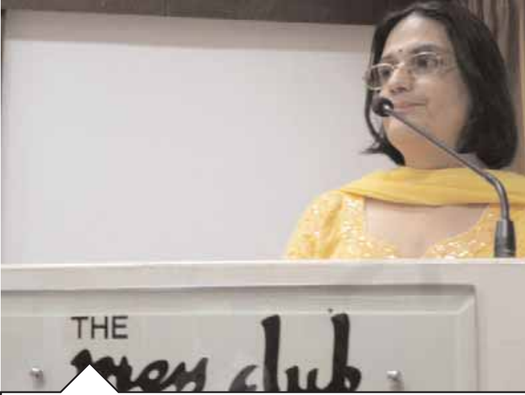
SANSKRITIRANI DESAI, AWARD-WINNING GUJARATI POET